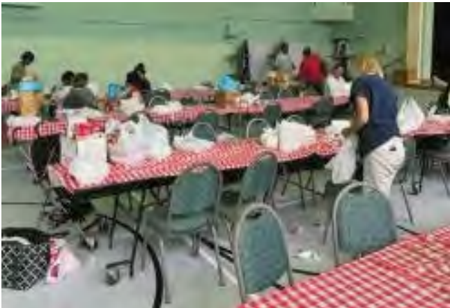
As the event progressed, many of the estimated 150 who came sat down to enjoy the meal in Maxwell Hall.