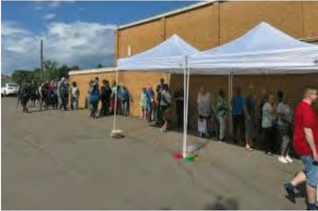
Crowds lined up early despite the heat, many having walked from their homes on the West Side.